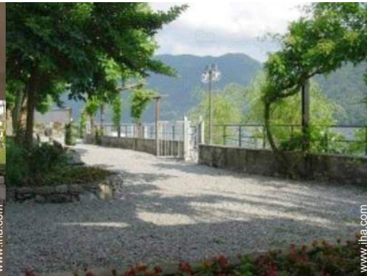
seaside pursuits nearby