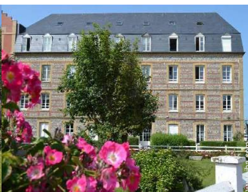
Restored apartment house/building