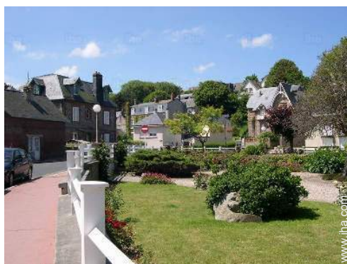
view of the village center