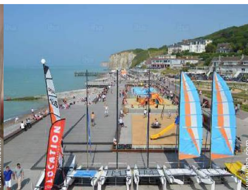
seaside pursuits nearby