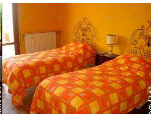
possible extra bed(s)