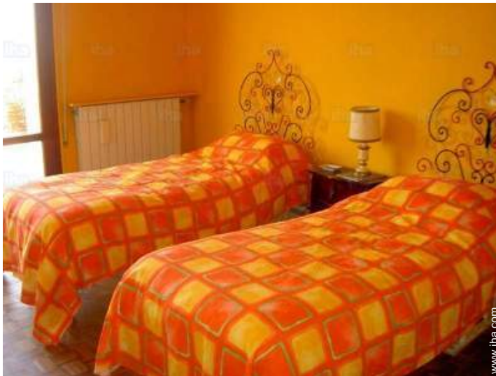
possible extra bed(s)