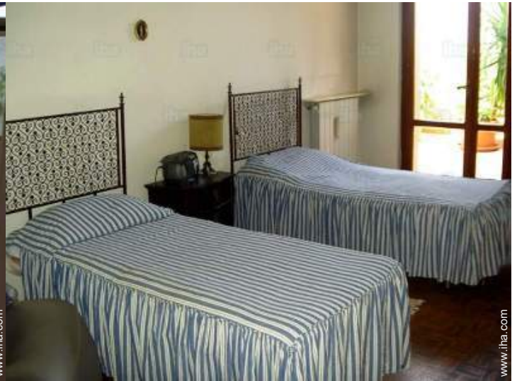
two twin beds