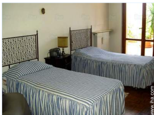
two twin beds