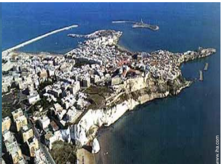
Cities close by