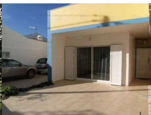
view from the sitting-room