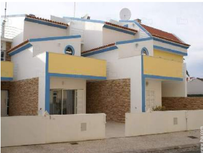
Single family home