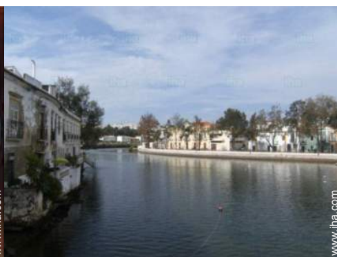
Cities close by