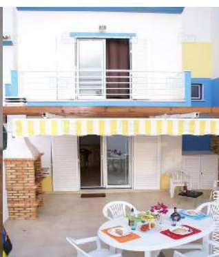
view from the terrace