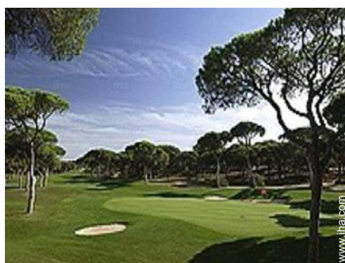
18 hole golf course