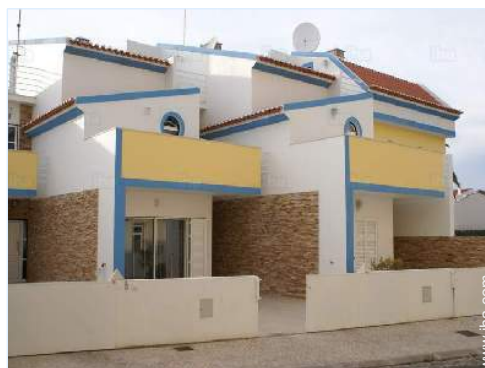
Single family home