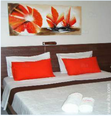
Sleeps - bed(s)