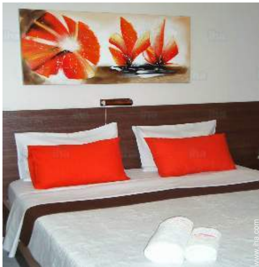
Sleeps - bed(s)