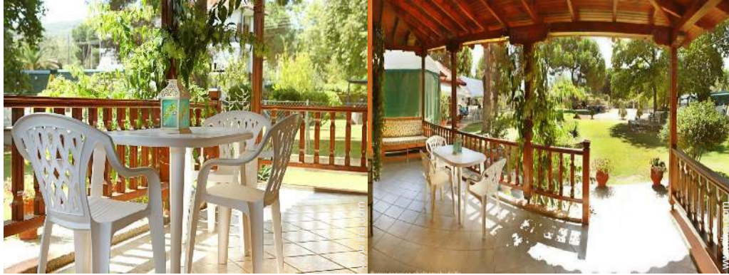
view from the balcony