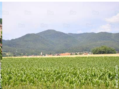
view over the mountain