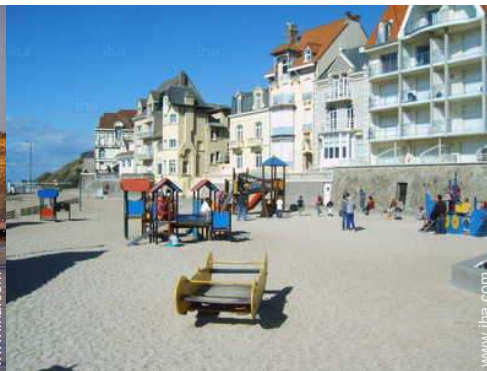
Attractions and relaxation