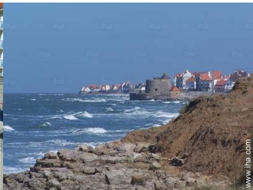
Cities close by