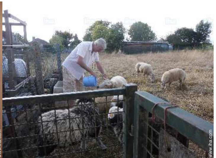
view over farmland