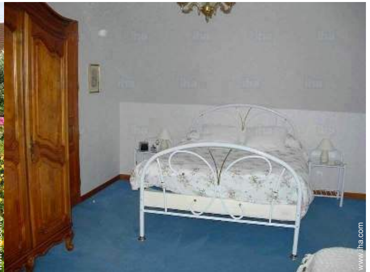
The guest room