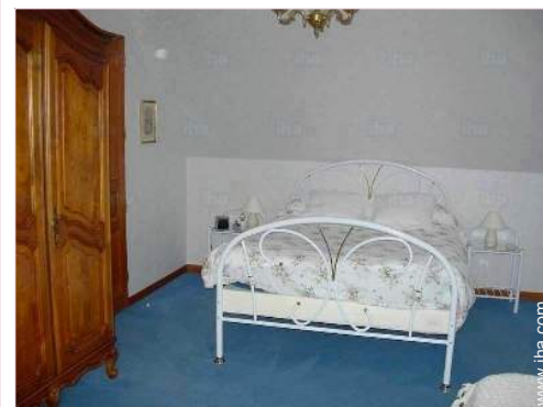
The guest room