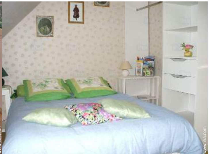
The guest room