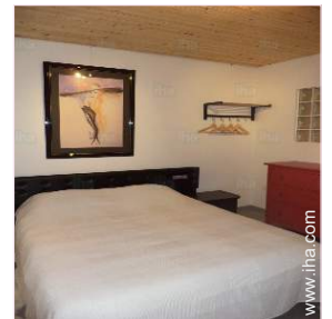
Charming Studio Flat